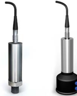
Gauge pressure Differential pressure